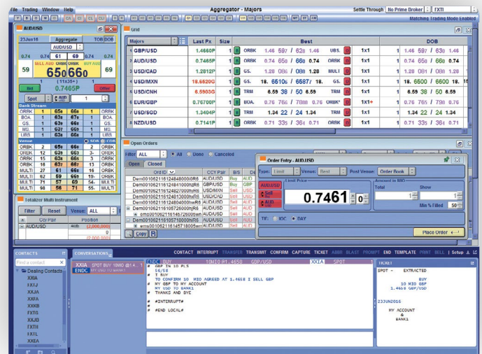
FX Trading application window